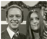
He Died 15 Years Ago, Now His Family Confirms The Rumors