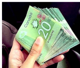
Vancouver Casino Insider Exposes A Legal Trick That Can't Be Stopped